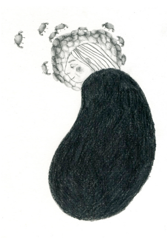
<u>Format</u>: 15x24, paper cover with flaps 64 pages B/W