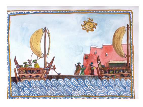
int. page :